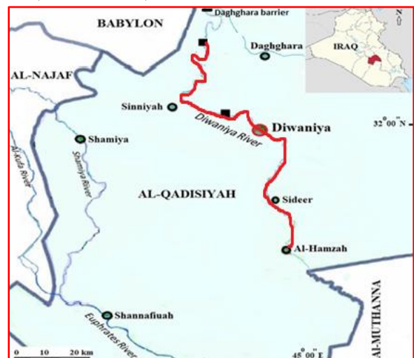
Figure. 1. Map of field sampling sites in Al-Diwaniya River

A total of 100 live O. aureus fish was collected from the AL-Diwaniya River between Daghghara barrier through Sinniyah district to the AL-Diwaniya city, The fish length ranged between 10-25 cm and the weight was 40-450 g. It is AL-Diwaniya River 123 km long, 25-30m wide and 3-5m depth (Fig. 1). Fish sampling was using seine net, gill nets, cast net. The sampling was done during the period from April 2021 till March 2022. The live fishes were transported to oxygenated pond water before their transferring to the laboratory in the College of Veterinary Medicine, University of Al-Qasim Green. The collected fishes were dissected and bacteria were taken aseptically, by using a sterile loop, from skin, gills and intestine. For isolation of bacteria, MacConkey agar medium was used. The inoculated plate was incubated at 37°C for 24 h. Bacteria were identified and antibiotic susceptibility (Ampicillin, Piperacillin/ Tazobactan, Cefazolin, Cefoxitin, Ceftazidime Ceftriaxone, Cefepime, Ertapenem Imipenem, Amikacin, Gentamicin Nitrofurantion, Ciprofloxacin, Levofloxacin, Tigecycline, and Trimethoprim/ Sulfamethoxazole) by using the Vitek 2 system. The bacteria were re-cultured on MacConkye agar, placed in the incubator for 24 h. and sent for examination in the Vitek 2 (Tables 1&2).